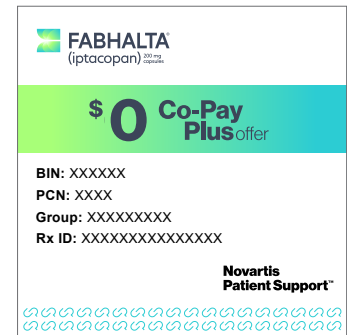
Co-Pay Plus Card

Call your dedicated Novartis Patient Support team to access your Vaccination Card and learn more about the Co-Pay Plus offer.